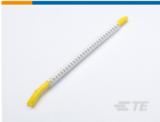
TE Part #092790-000 STD Snap-On Markers