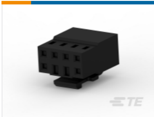
TE Part #2316110-8 8P,2MM,REC,HSG,DR,CRIMP,LATCH, BOX