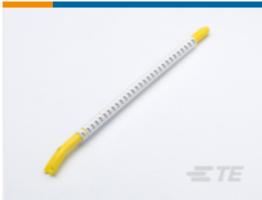
TE Part #321874-000 STD Snap-On Markers