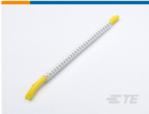
TE Part #403072-000 STD Snap-On Markers