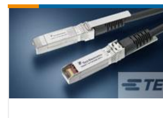
TE Part #1-2032757-1 C/A, ACTIVE SFP+ TO SFP+, T1 10M 28AWG