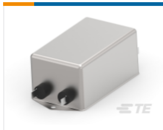
TE Part #2-6609037-6 12EP1=F8217