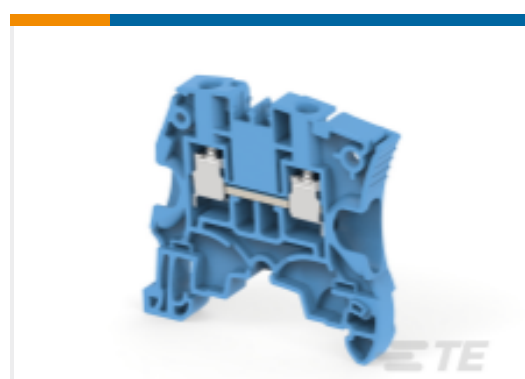
TE Part #1SNK506020R0000 ZS6-BL