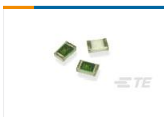
TE Part #2-2176094-6 RP 2A 0.25W 221K 0.1% 25PPM 1K RL