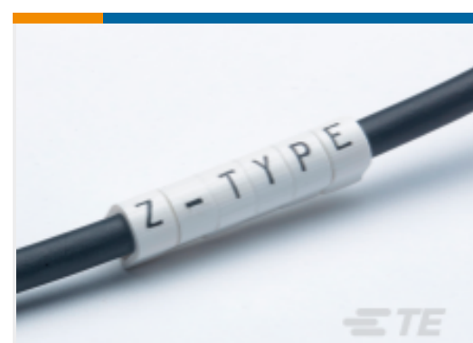
TE Part #EJ1952-000 06151412