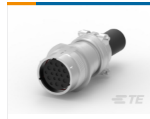
TE Part #HD34-24-19SE-059 REC,19P,AL,E,CBLCLMP BT,DRAIN,12 /16,S,MC