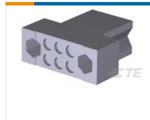
TE Part #202757-1 6 POS. FEM. BLOCK