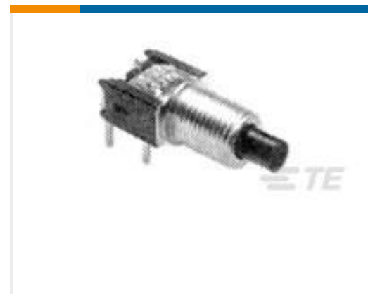
TE Part #1825100-4 TPF11CGRA004