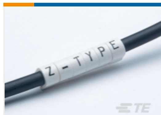
TE Part #EJ1952-000 06151412