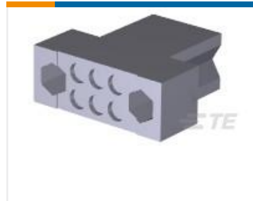
TE Part #202757-1 6 POS. FEM. BLOCK