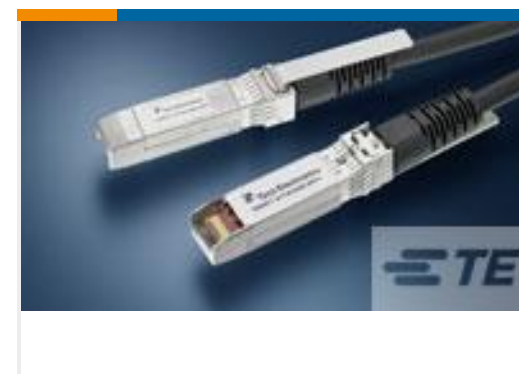
TE Part #1-2032757-1 C/A, ACTIVE SFP+ TO SFP+, T1 10M 28AWG