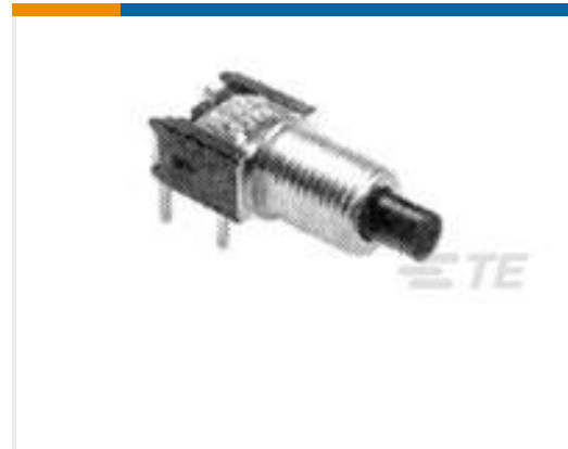
TE Part #1825100-4 TPF11CGRA004