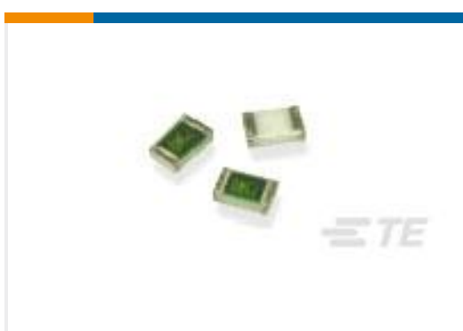
TE Part #2-2176094-6 RP 2A 0.25W 221K 0.1% 25PPM 1K RL