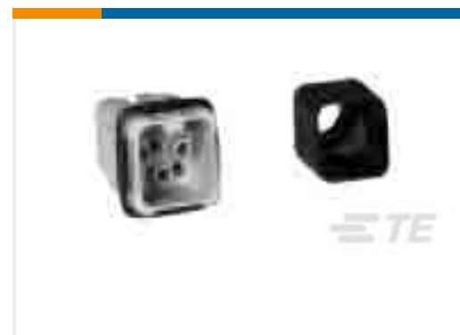
TE Part #2-1103104-3 HN.D.8.STI.C