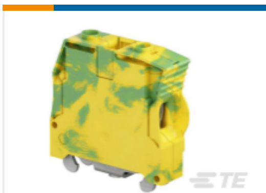
TE Part #1SNK516151R000 ZS50-PE