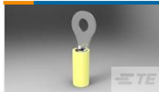
TE Part #321019 TERMINAL,PIDG R 26-22 6