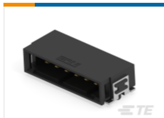
TE Part #254699-E SRCA 2,54 6 M 1 SMD 137 E1 094 * GURT *