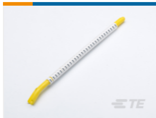
TE Part #422172-000 STD Snap-On Markers