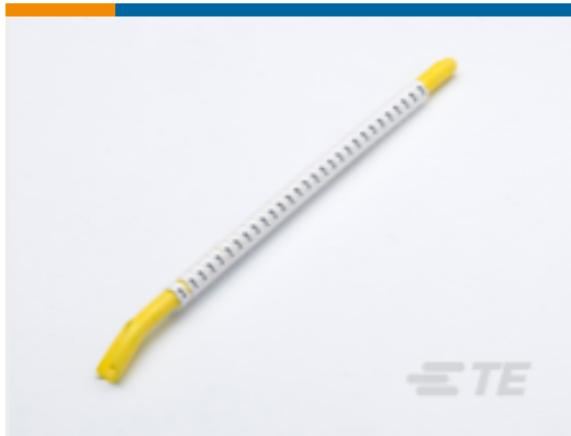
TE Part #422172-000 STD Snap-On Markers