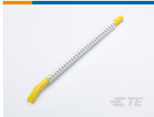
TE Part #369880-000 STD Snap-On Markers