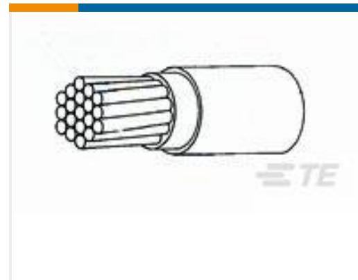
TE Part #282046-020 44A0111-24-6