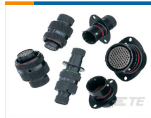
TE Part #AS710-35PN RECEPT.JAM NUT TYPE 7