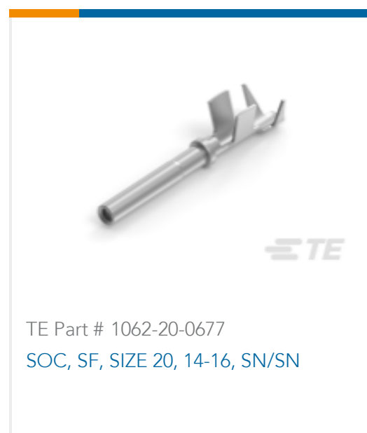
TE Part # 1062-20-0677 SOC, SF, SIZE 20, 14-16, SN/SN