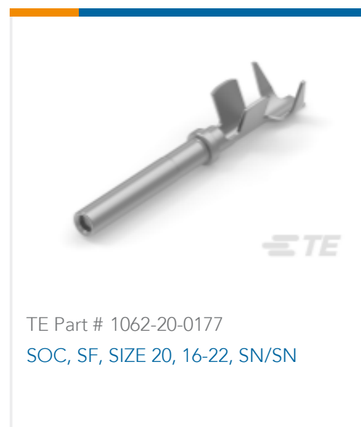
TE Part # 1062-20-0177 SOC, SF, SIZE 20, 16-22, SN/SN