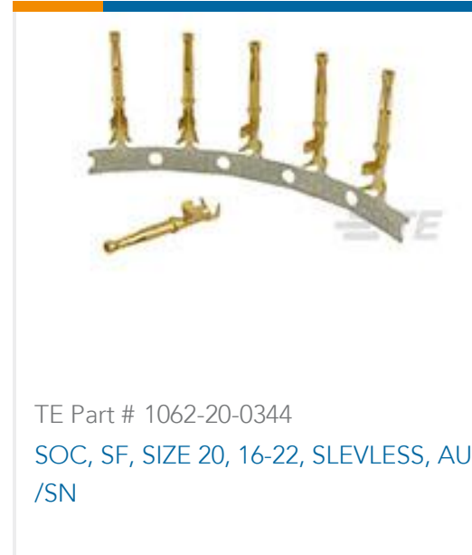
TE Part # 1062-20-0344 SOC, SF, SIZE 20, 16-22, SLEVELESS, AU /SN