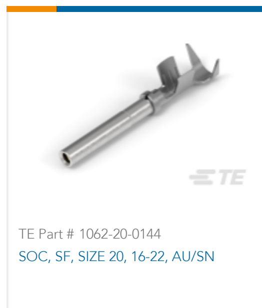
TE Part # 1062-20-0144 SOC, SF, SIZE 20, 16-22, AU/SN