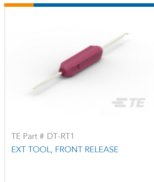
TE Part # DT-RT1 EXT TOOL, FRONT RELEASE