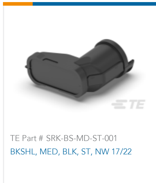
TE Part # SRK-BS-MD-ST-001 BKSHL, MED, BLK, ST, NW 17/22