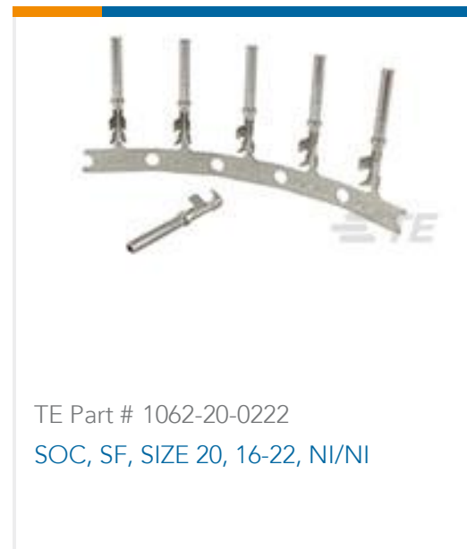
TE Part # 1062-20-0222 SOC, SF, SIZE 20, 16-22, NI/NI