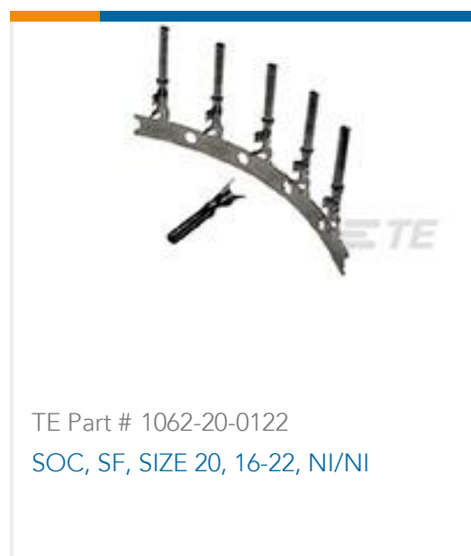
TE Part # 1062-20-0122 SOC, SF, SIZE 20, 16-22, NI/NI