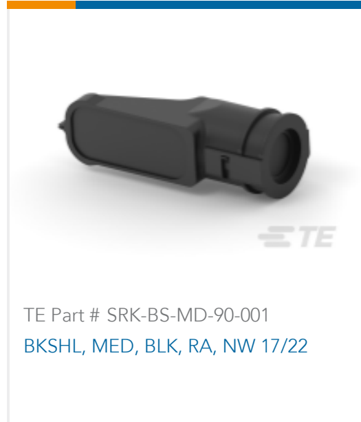
TE Part # SRK-BS-MD-90-001 BKSHL, MED, BLK, RA, NW 17/22