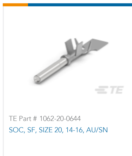
TE Part # 1062-20-0644 SOC, SF, SIZE 20, 14-16, AU/SN