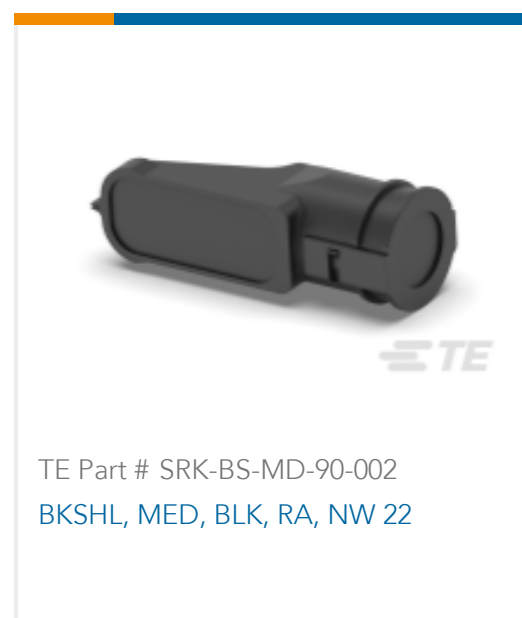
TE Part # SRK-BS-MD-90-002 BKSHL, MED, BLK, RA, NW 22