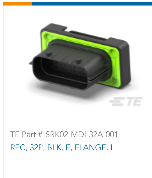
TE Part # SRK02-MDI-32A-001 REC, 32P, BLK, E, FLANGE, I