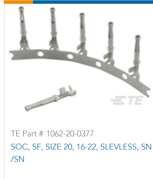
TE Part # 1062-20-0377 SOC, SF, SIZE 20, 16-22, SLEVELESS, SN /SN