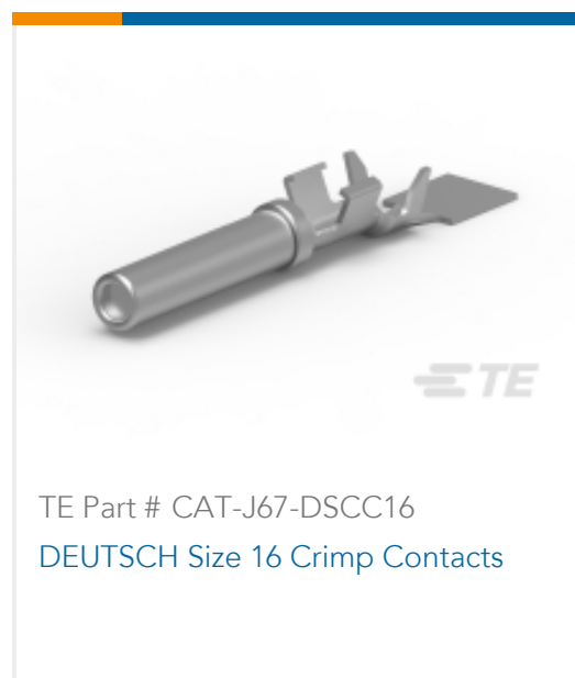
TE Part # CAT-J67-DSCC16 DEUTSCH Size 16 Crimp Contacts