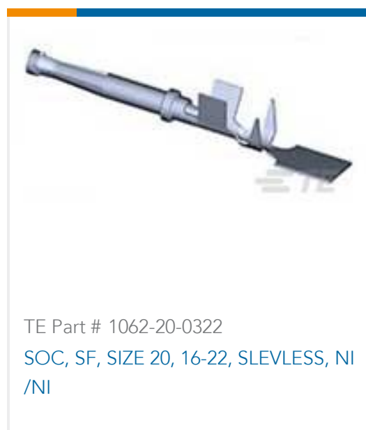
TE Part # 1062-20-0322 SOC, SF, SIZE 20, 16-22, SLEVELESS, NI /NI