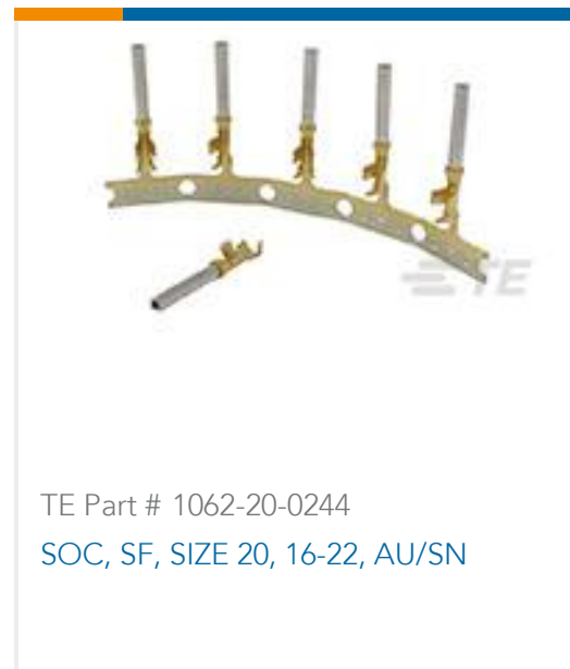
TE Part # 1062-20-0244 SOC, SF, SIZE 20, 16-22, AU/SN