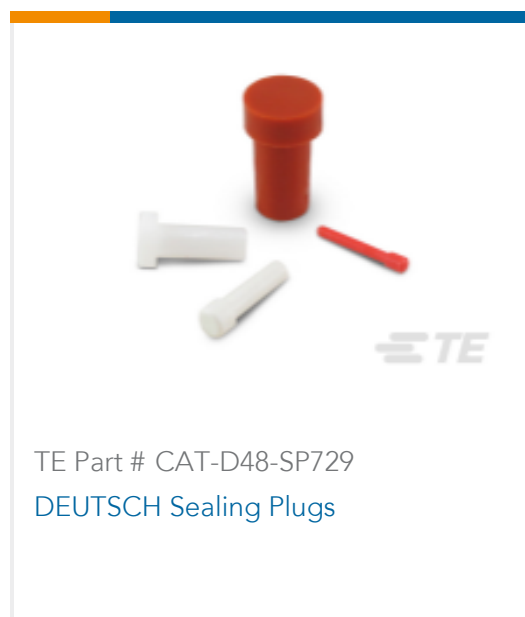
TE Part # CAT-D48-SP729 DEUTSCH Sealing Plugs