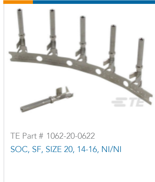
TE Part # 1062-20-0622 SOC, SF, SIZE 20, 14-16, NI/NI