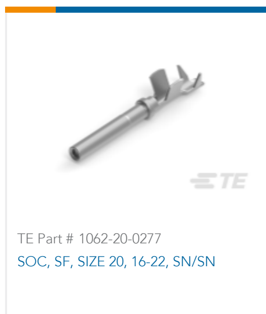
TE Part # 1062-20-0277 SOC, SF, SIZE 20, 16-22, SN/SN