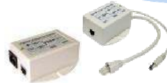
Power Over Ethernet Injectors & Splitters Part No. POE-XXi . POE-XXs-afi