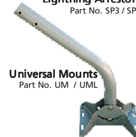
Universal Mounts Part No. UM / UML