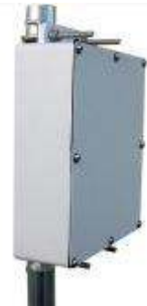
Die Cast Aluminum Enclosure Part No. DCE-7x6x2