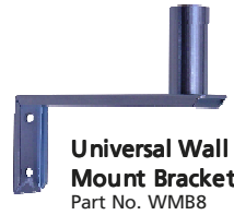
Universal Wall Mount Bracket Part No. WMB8