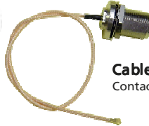
Cable Assemblies Contact us for more info!