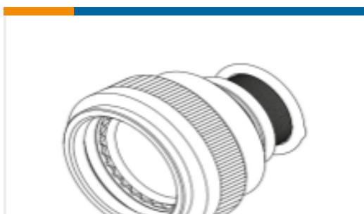
TE Part #337735-000 TXR40BW00-1608AI