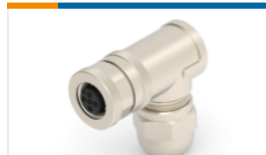
TE Part #T4112011031-000 M12 F, 3P GOLD A_CODE RA SHIELDED PG7