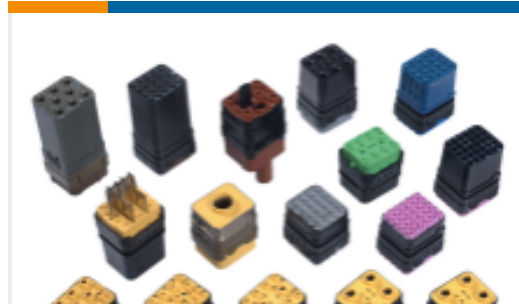
TE Part #ZPF000000000105361 DMC-M 22-05 SN