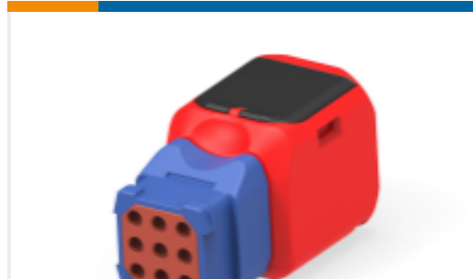
TE Part #YD369-P99-AS000000 Rectangular Connectors: 9-Way Plug