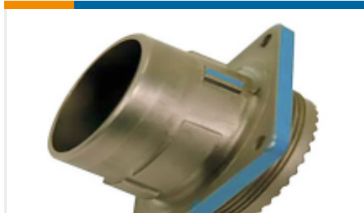
TE Part #YDIV40E25-61SNV001 RECP ASSY