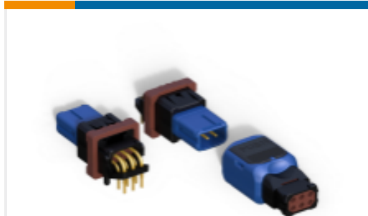
TE Part #YD369-B99-AP000000 369 9 WAY PANEL MNT REC, NO CONTACTS,PIN