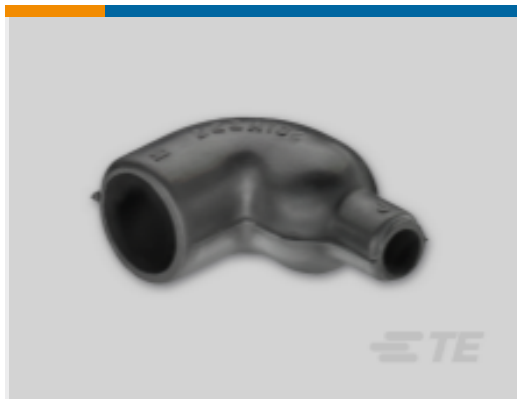
TE Part #806823-000 Bulbous Heat Shrink Boots: Lipped, Right Angle