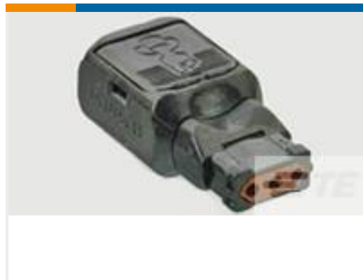
TE Part #D369-P33-NS1 369 3 WAY PLUG, CRIMP, SKT