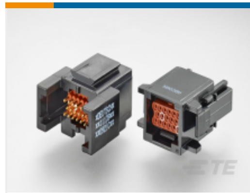
TE Part #ABC06N-22P IN-LINE PLUG