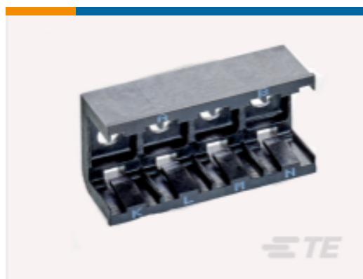
TE Part #DCR-1A-06 COMPOSIT RAIL