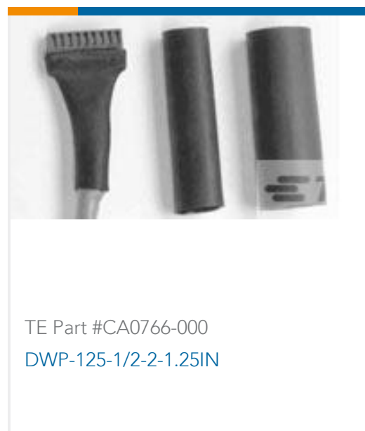
TE Part #CA0766-000 DWP-125-1/2-2-1.25IN