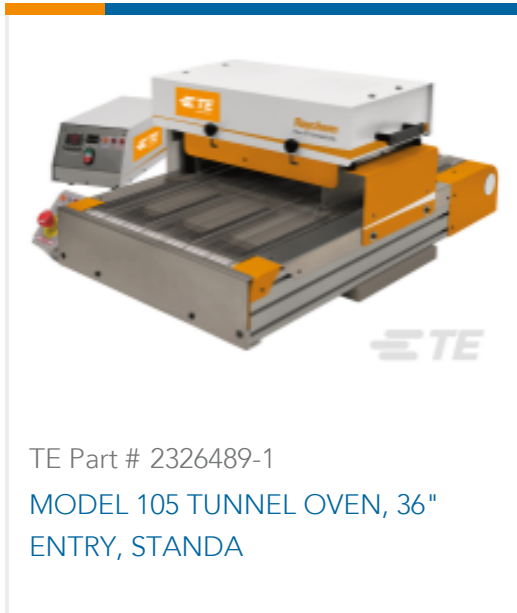
TE Part # 2326489-1 MODEL 105 TUNNEL OVEN, 36" ENTRY, STAND