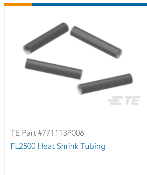
TE Part #771113P006 FL2500 Heat Shrink Tubing