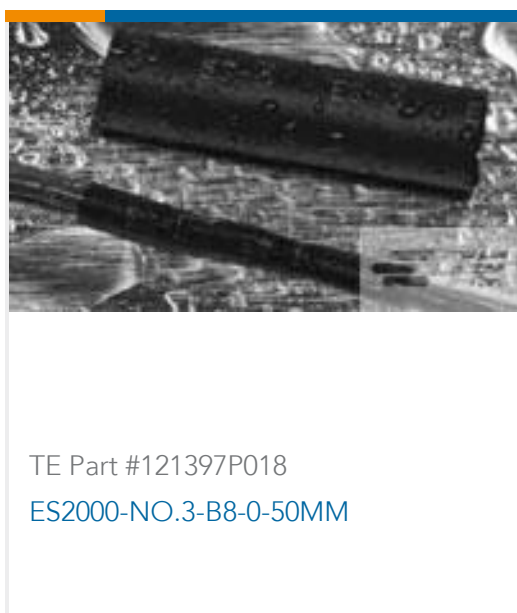
TE Part #121397P018 ES2000-NO.3-B8-0-50MM