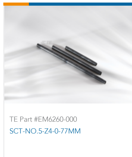
TE Part #EM6260-000 SCT-NO.5-Z4-0-77MM