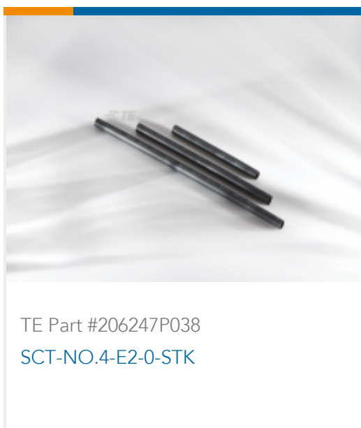
TE Part #206247P038 SCT-NO.4-E2-0-STK