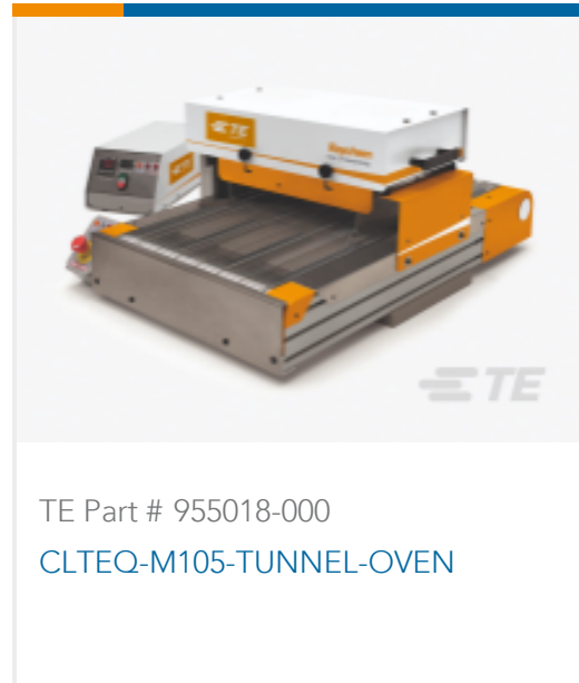
TE Part # 955018-000 CLTEQ-M105-TUNNEL-OVEN