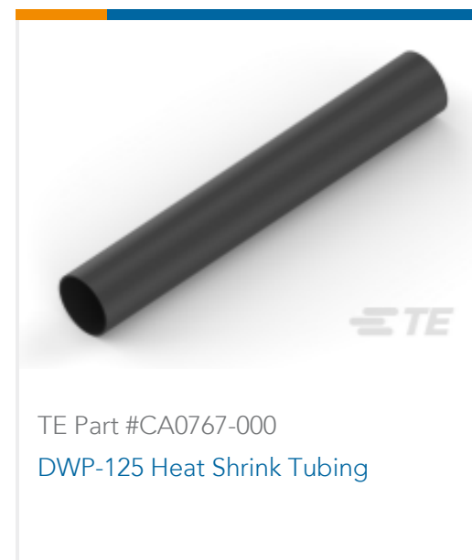
TE Part #CA0767-000 DWP-125 Heat Shrink Tubing