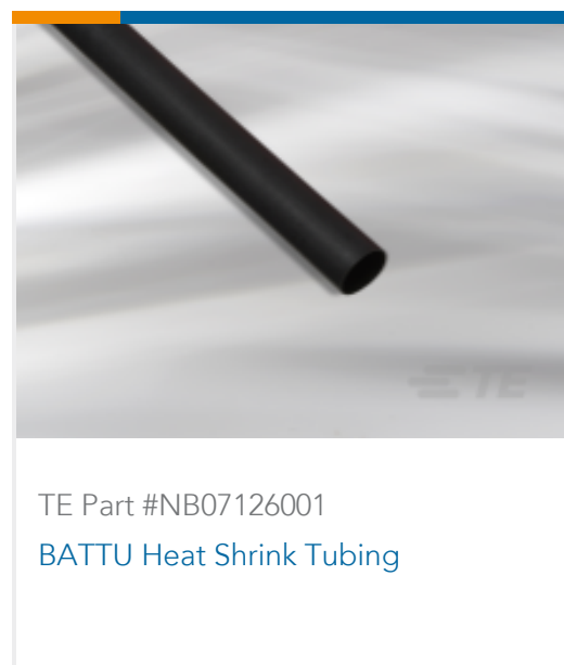
TE Part #NB07126001 BATTU Heat Shrink Tubing