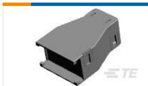
TE Part #1986185-1 Strain Relief,6 Posn,D5200 Dynamic. 2