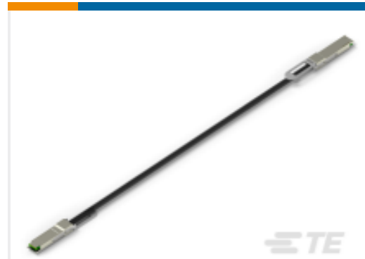
TE Part #2333393-7 QSFP 25GIG 30AWG 3 METER