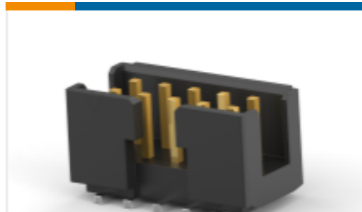
TE Part #1-2373376-0 10P,2MM,SHRD HDR,DRV,T,SMD,0.1 AU,TB