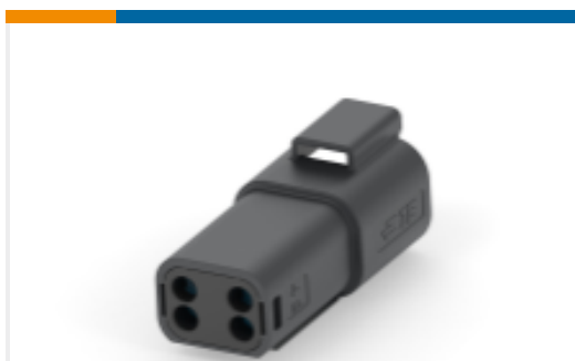
TE Part #1-2600030-0 4CCT BLACK RECEP W/LARGE SEAL