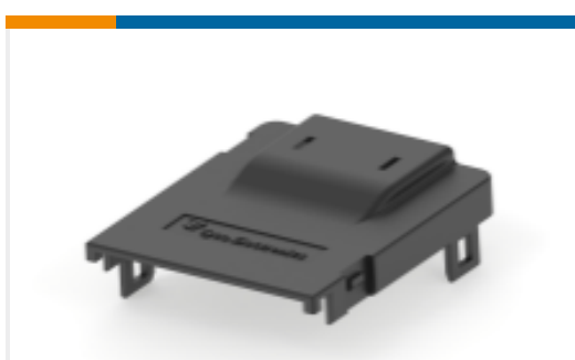
TE Part #1986186-1 Strain Relief,20 Posn,D3000 Dynamic, 2