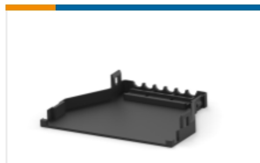
TE Part #1776695-1 Strain Relief, D5200, Dynamic