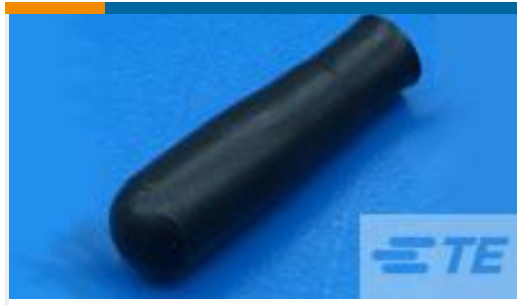
TE Part #610001-000 D-300-08