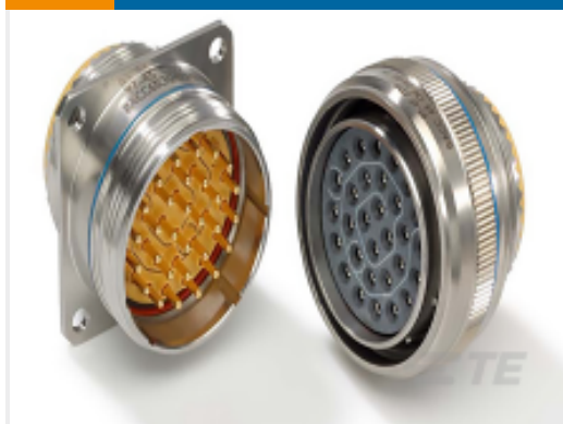
TE Part #ZPF000000000008176 983-6K 24-61 SN