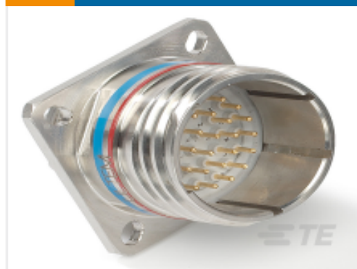
TE Part #YDTS20Z13-08PNC001 RECP ASSY