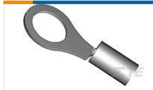
TE Part #323167 STRATO-THERM, HR 8 5/16 NIPL