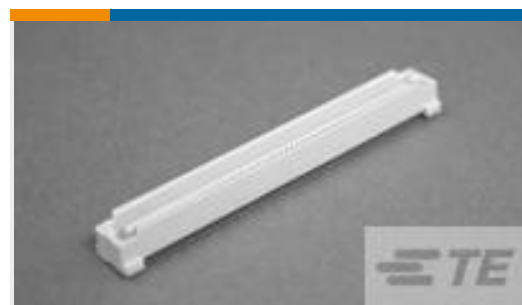
TE Part #5177984-3 0.8FH,P05H.5,080,08/Sn,TU