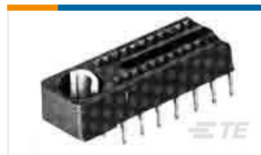
TE Part #534175-6 MINI BOX RECP ASSY 70 POS SEAL