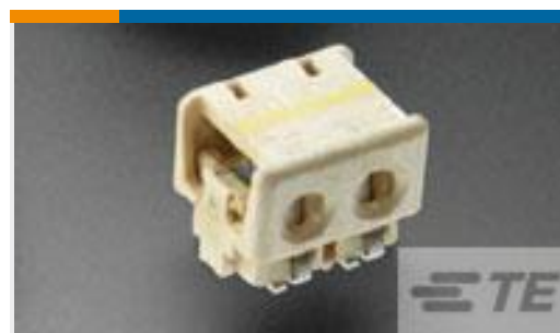
TE Part #2106003-1 Connector, SMT-IDC, 1 POS, 18 AWG