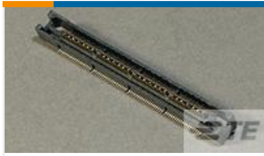
TE Part #2-5767004-5 MICTOR RECEPT ASSY, 152 POS.