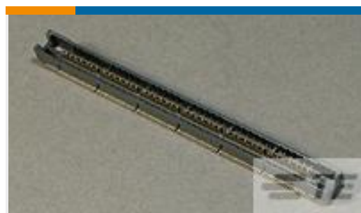
TE Part #2-5767004-7 MICTOR RECEPT ASSY, 228 POS.