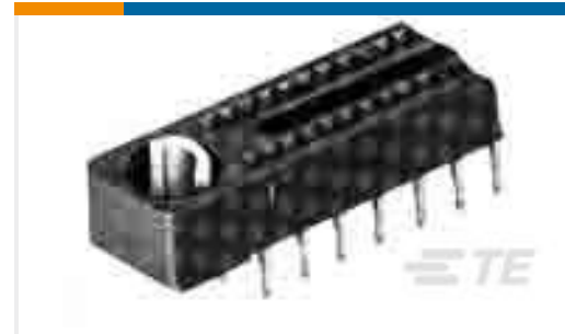
TE Part #534175-1 MINI BOX RECP 128 POS SEALED