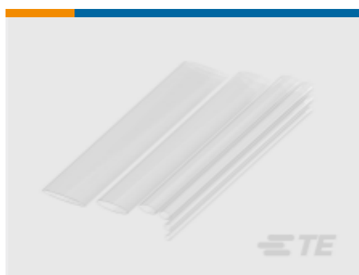
TE Part #NB12834001 RNF-100-1/2-CL-SP