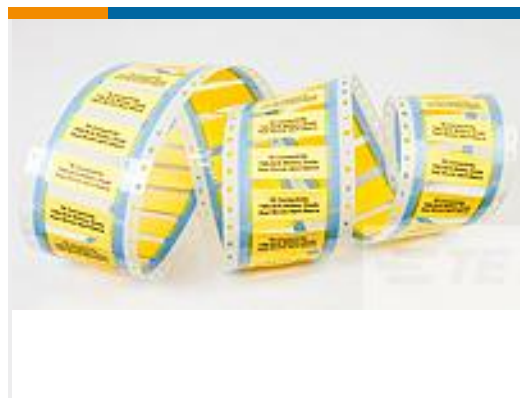
TE Part #6315830001 TMS-SCE-3/4-2.0-4