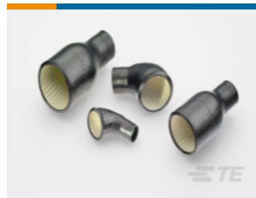
TE Part #EK7307-000 222S132-25C-0