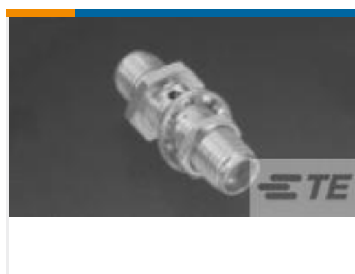
TE Part #1054869-1 2084 0000 02