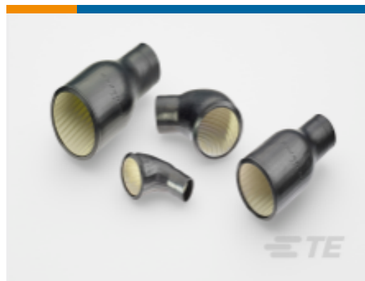
TE Part #EK7273-000 202S132-25C-0