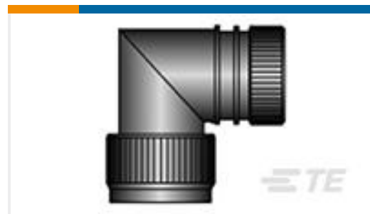
TE Part #012481-000 HEX40-AC-90-13-A3-C