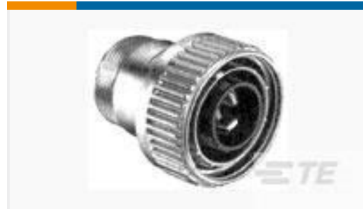
TE Part #208496-1 CMC PLUG ASSEMBLY, SZ 22