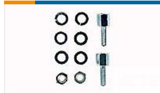
TE Part #5745563-1 HD KIT, SCREWLOCK FEMALE