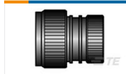
TE Part #600924-000 HEXA6-AC-00-02-A25-1