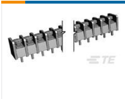
TE Part #1-1437667-9 4DB-P107-12=4DB ASSEMBLY