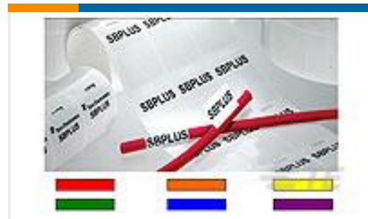
TE Part #CN9922-000 SBP100225WE5