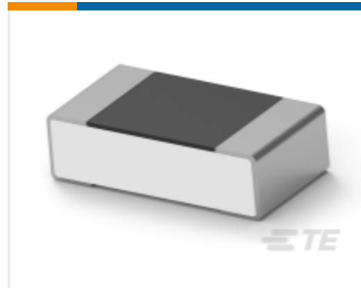
TE Part #9-2176371-0 RQ 0603 39K2 0.1% 10PPM 5K RL