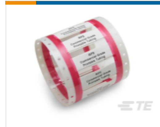
TE Part #8374950001 RPS Commercial Grade Sleeves