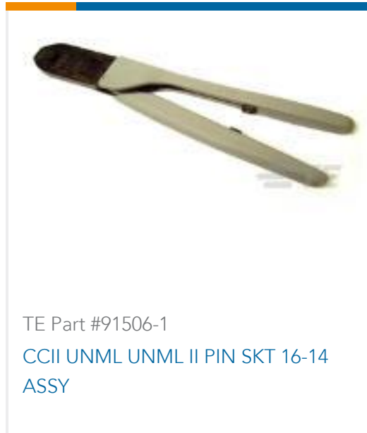
TE Part #91506-1 CCII UNML UNML II PIN SKT 16-14 ASSY