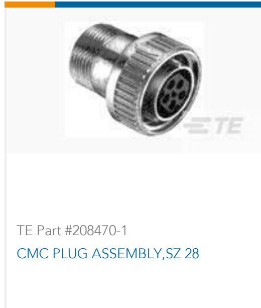
TE Part #208470-1 CMC PLUG ASSEMBLY, SZ 28