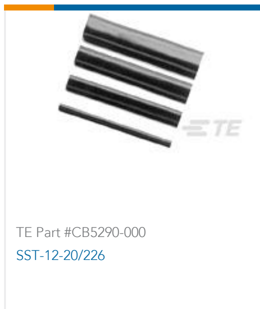
TE Part #CB5290-000 SST-12-20/226