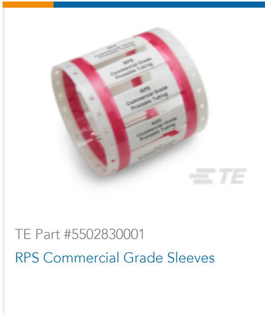
TE Part #5502830001 RPS Commercial Grade Sleeves