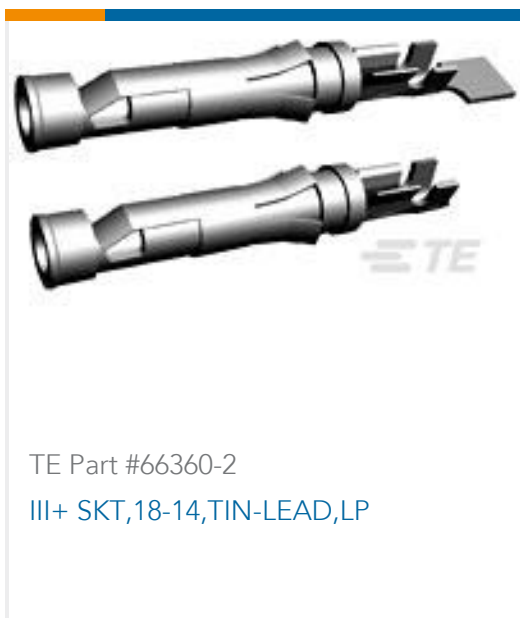
TE Part #66360-2 III+ SKT, 18-14, TIN-LEAD, LP