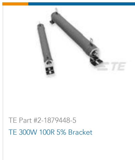
TE Part #2-1879448-5 TE 300W 100R 5% Bracket