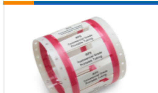
TE Part #3234330001 RPS Commercial Grade Sleeves