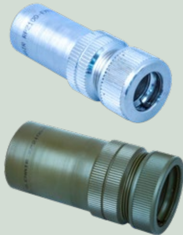
RP2100-G Cadmium / Olive Drab finish option