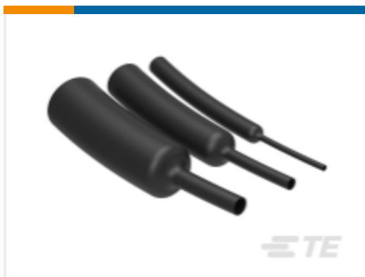
TE Part #5677834001 RNF-3000 Heat Shrink Tubing