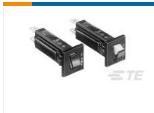
TE Part #3-1393250-1 W28-XQ1A-16=W28