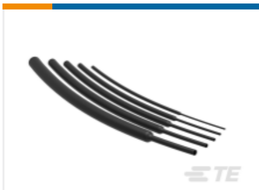
TE Part #F75818-000 RNF-100-BK Heat Shrink Tubing