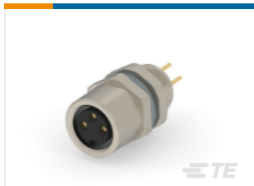
TE Part #T4043014031-000 M8.FMLE.PNLFRONT.3POS.STRPCB