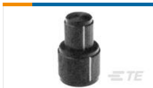
TE Part #5-1437622-7 KN5700B1/4=KNOB BLACK PAIR 1/8