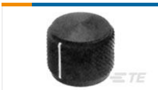
TE Part #7-1437621-2 KD500B1/4=KNOB BLK DIAMOND KNU