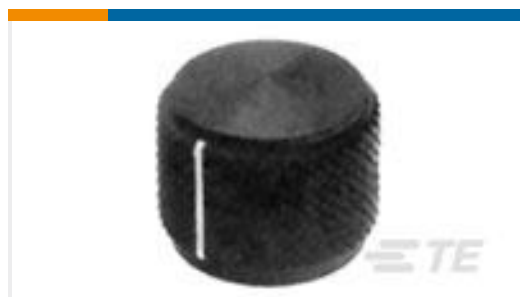
TE Part #7-1437621-3 KD500B1/8=KNOB BLK DIAMOND KNU