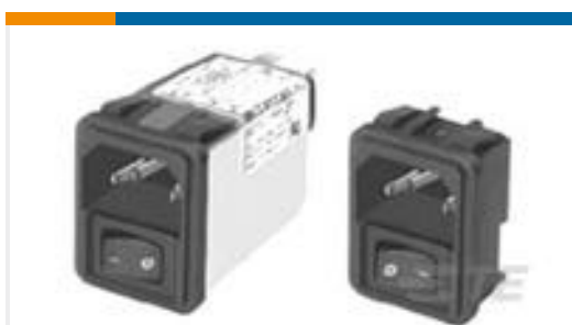
TE Part #1609112-8 10CS1 M0=F7803