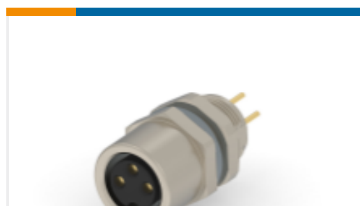
TE Part #T4043014031-000 M8.FMLE.PNLFRONT.3POS.STRPCB