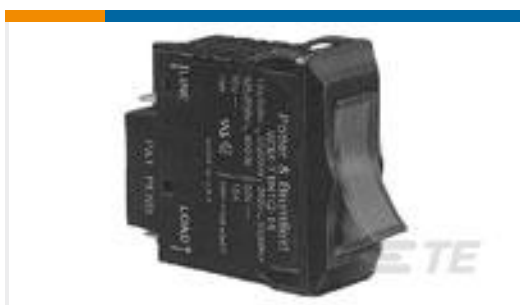
TE Part #1393248-5 W33-S1N1Q-10=W33