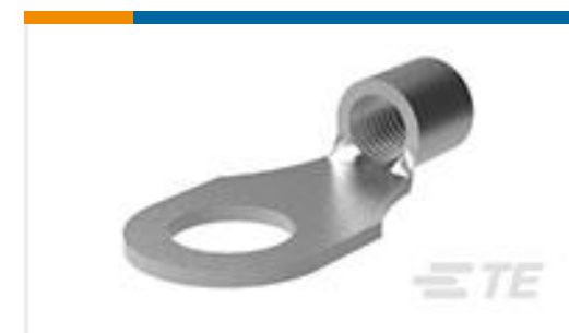
TE Part #8-320383-3 TERMINAL,SOLIS R 2 1/4