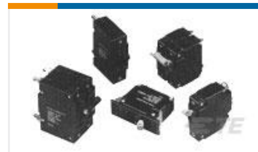
TE Part #8-1393254-1 W92-X112-5=M6/M7/M9/W6/W7