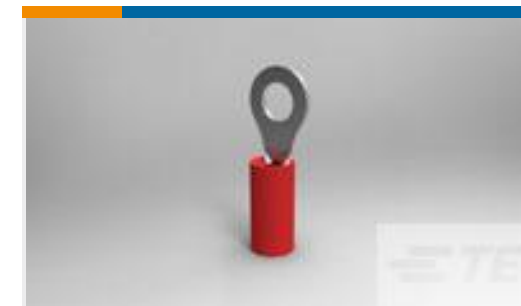
TE Part #171508-5 PIDG RING UL.CSA(22-16)