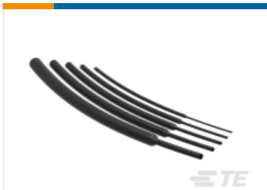
TE Part #E40866-000 RNF-100-BK Heat Shrink Tubing