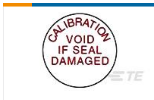
TE Part #1878643-6 M5031C