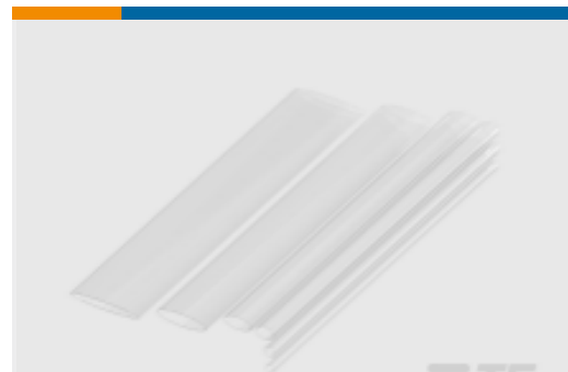
TE Part #NB15524001 RNF-100-CL Heat Shrink Tubing