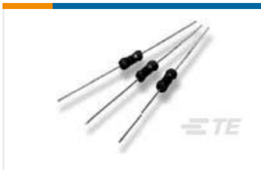
TE Part #6-1625892-0 3W SM M/OX 5% 56R