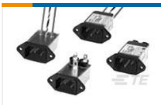
TE Part #6609015-5 6EF1F=F7325 S0