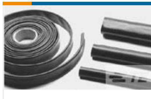
TE Part #CB5036-000 BSTS-13X4