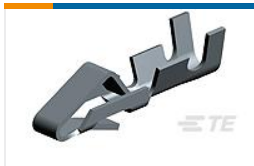
TE Part #350980-3 .045 POST CONTACT AUPLBR