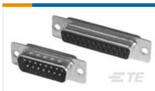
TE Part # 5-747917-2 37 Rcpt Solder Cup, Gold Flash