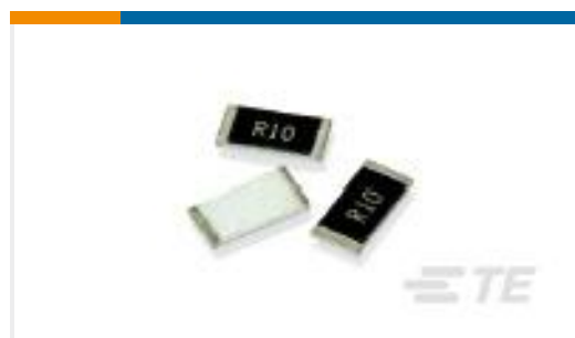
TE Part # 1-1622825-6 RL73K 3A R22 5% 1K RL