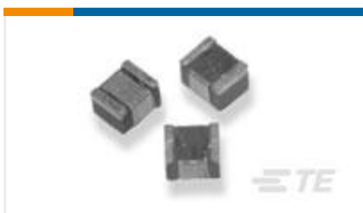
TE Part # 6-1624113-2 3650 0805 0.56uH 5% 2K RL