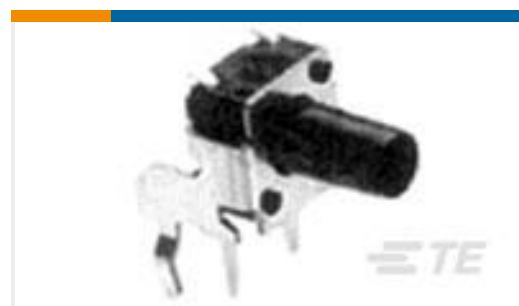
TE Part # 1-1825027-4 FSMRA5JH04=R/A,TACT PB SW,160G