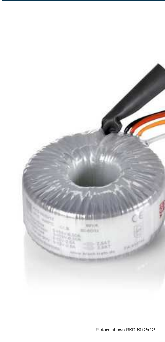
Picture shows RKD 60 2x12