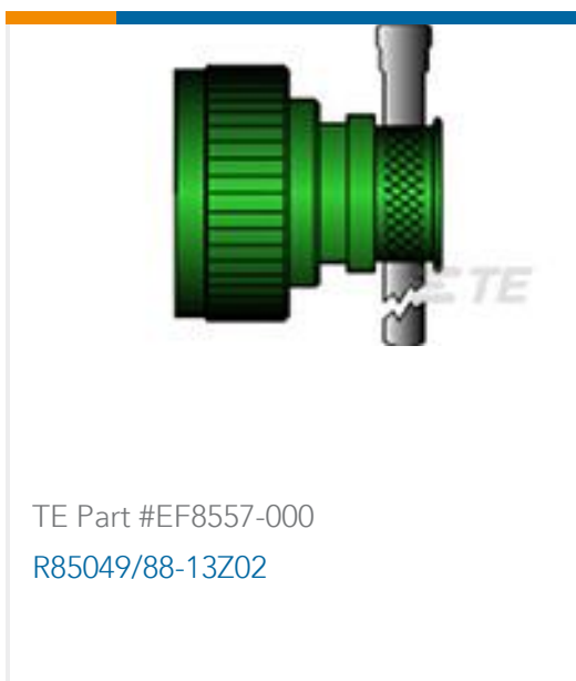
TE Part #EF8557-000 R85049/88-13Z02