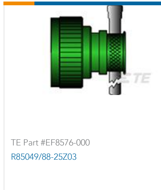
TE Part #EF8576-000 R85049/88-25Z03