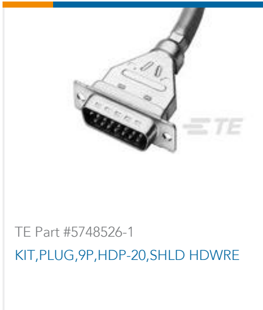
TE Part #5748526-1 KIT, PLUG, 9P, HDP-20, SHLD HDWRE