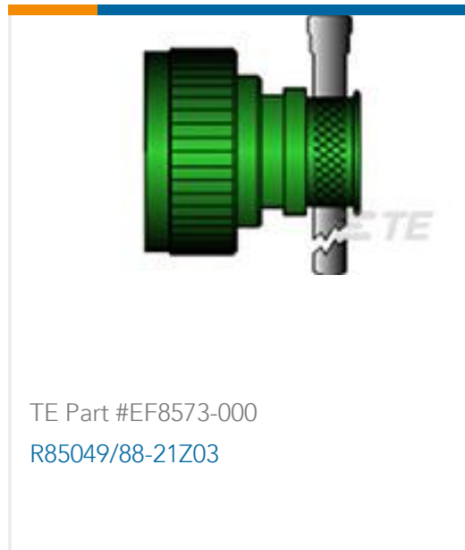
TE Part #EF8573-000 R85049/88-21Z03