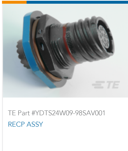
TE Part #YDTS24W09-98SAV001 RECP ASSY