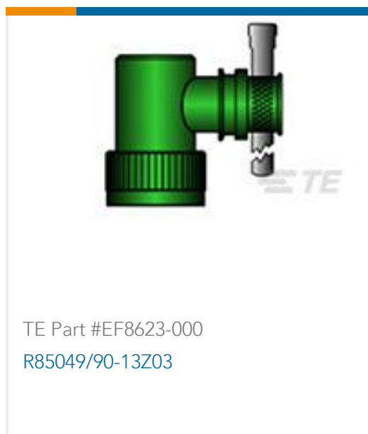
TE Part #EF8623-000 R85049/90-13Z03