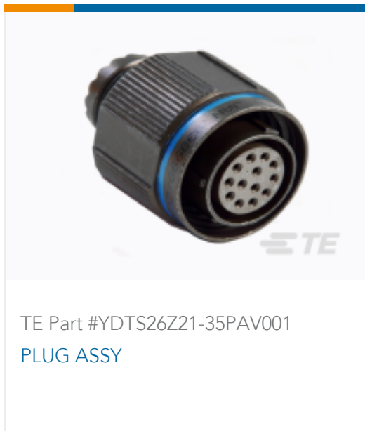
TE Part #YDTS26Z21-35PAV001 PLUG ASSY