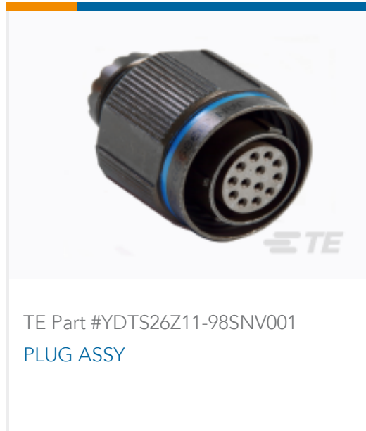
TE Part #YDTS26Z11-98SNV001 PLUG ASSY