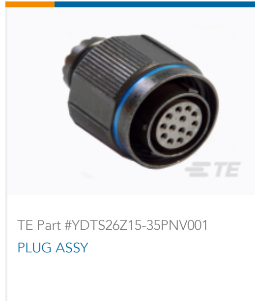
TE Part #YDTS26Z15-35PNV001 PLUG ASSY