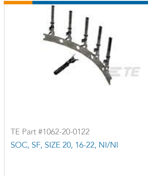
TE Part #1062-20-0122 SOC, SF, SIZE 20, 16-22, NI/NI