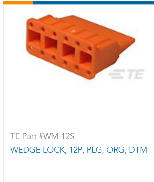
TE Part #WM-12S WEDGE LOCK, 12P, PLG, ORG, DTM