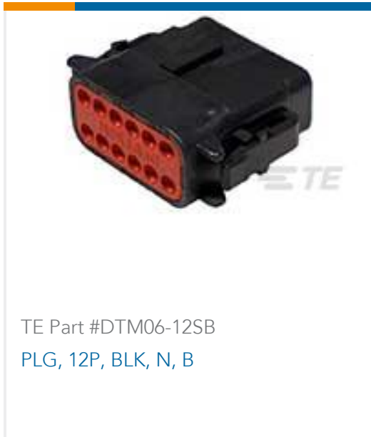
TE Part #DTM06-12SB PLG, 12P, BLK, N, B