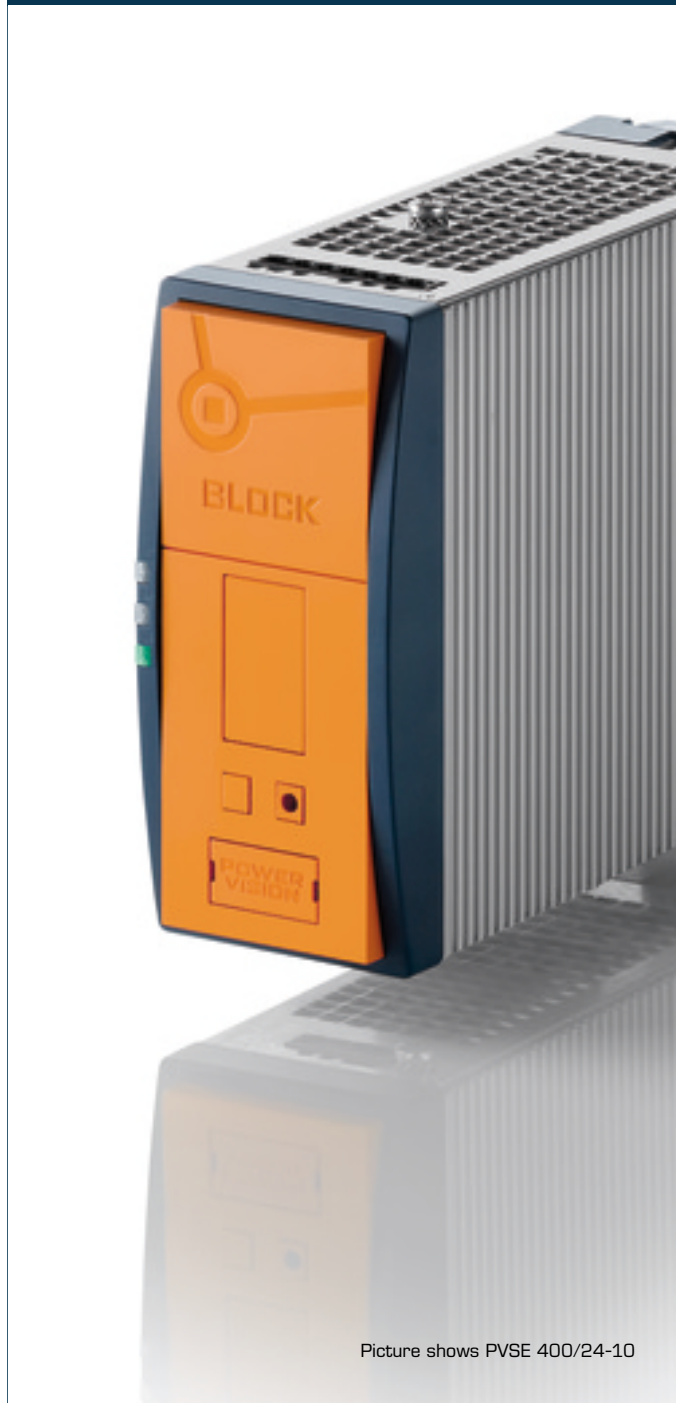
Picture shows PVSE 400/24-10