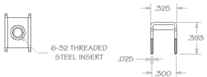
6-32 THREADED STEEL INSERT

ITW Pancon An Illinois Tool Works Company 309 E. Crossroads Parkway Bolingbrook IL 60440 Phone 1 888 515 2100 Fax 630 972 8900 www.itwpancon.com