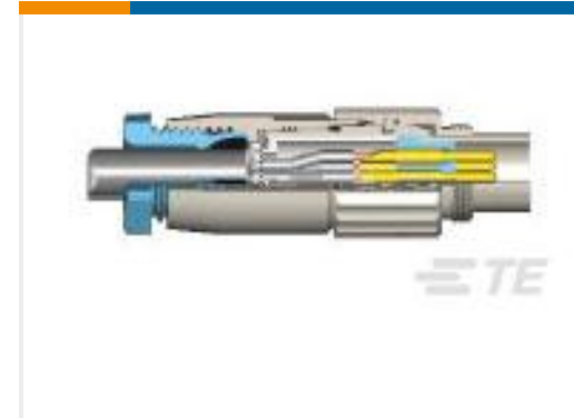
TE Part #1-1437719-5 T01-0550-P03-MALE PLUG CONNECTOR SOLDER