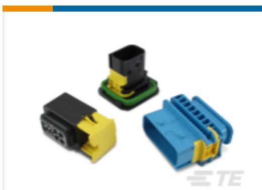
TE Part #2-1418479-1 Heavy Duty Sealed Connector Series Housings