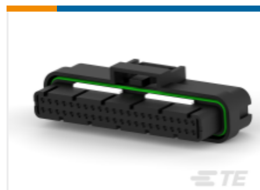
TE Part #2-1447232-6 3900281-441=SP/SEAL 44P PLUG