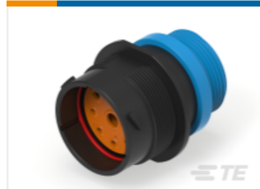
TE Part #HDP24-24-9PE-L015 REC, 9P, BLK, E, THD, 4/8/12, P