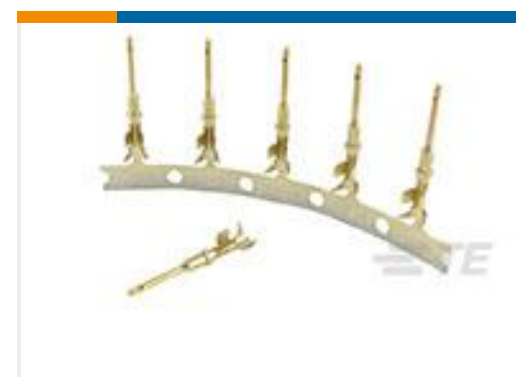
TE Part #1060-20-0144 PIN, SF, SIZE 20, 16-22, AU/SN