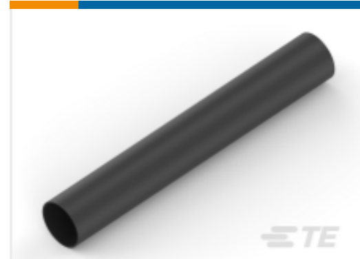
TE Part #5125934002 NETM1000 Heat Shrink Tubing