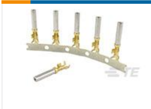
TE Part #1062-16-0144 SOC, SF, SIZE 16, 14-18, AU/SN