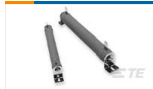
TE Part #2-1879453-5 TE 1000W 100R 5% Bracket