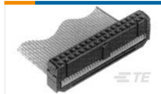
TE Part #1658622-1 10 NOVO MIL/CTR 30DP,LEAD FREE