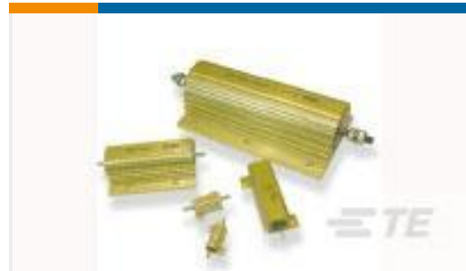
TE Part #4-1630012-0 HSC150 200R 5%