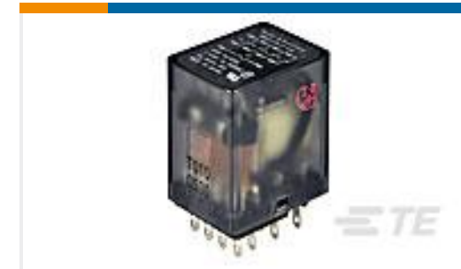
TE Part #7-1393122-1 KHAU-17D16-24=KH