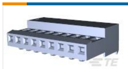
TE Part #3-640442-9 09P MTA100 CONN ASSY BLU