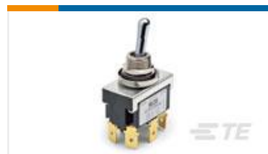
TE Part #7-6437630-2 AWTN1504 = POWER TOGGLE