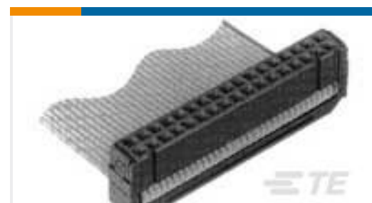
TE Part #1-1658623-0 50 NOVO MIL 30DP, LEAD FREE