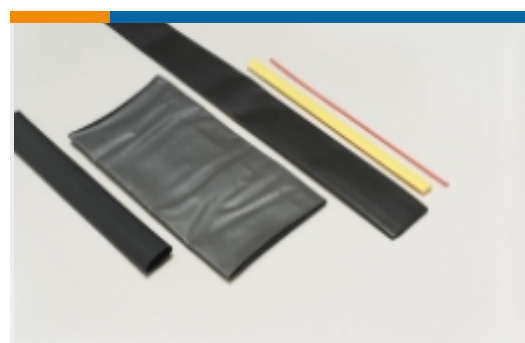
Heat Shrink Tubing(32)