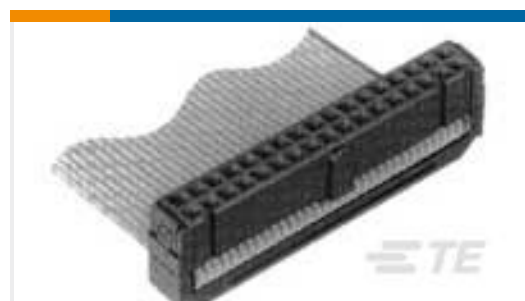
TE Part #1658622-1 10 NOVO MIL/CTR 30DP, LEAD FREE