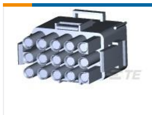
TE Part # 770023-1 15P UMNLII IN-LNE PLUG HSG KIT