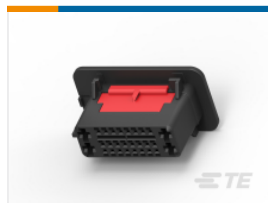
TE Part # 2112155-1 28POS MIXED MQS REC