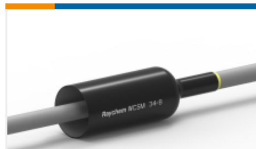
TE Part #CU7128-000 WCSM-34/8-1000/S(S10)