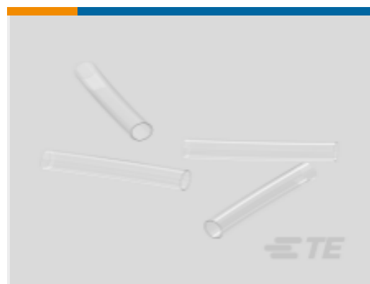
TE Part # CAT-HST-RT375 RT-375 Heat Shrink Tubing