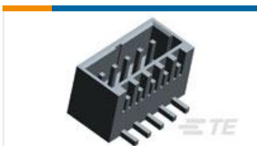
TE Part # 5-1775443-2 EMIX CONN., 1.5MM PITCH, HDR, V /T, 2P