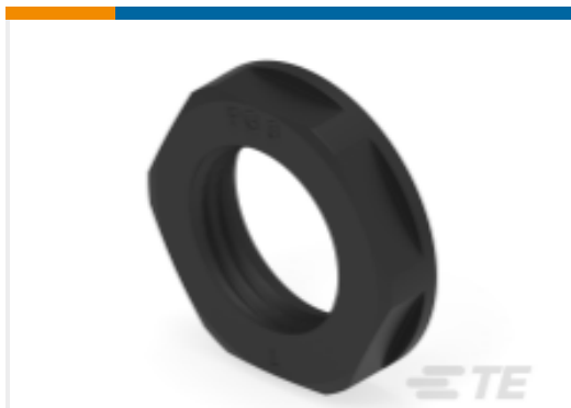
TE Part # 1SNG607045R0000 EP-LN-PG9-BL-A