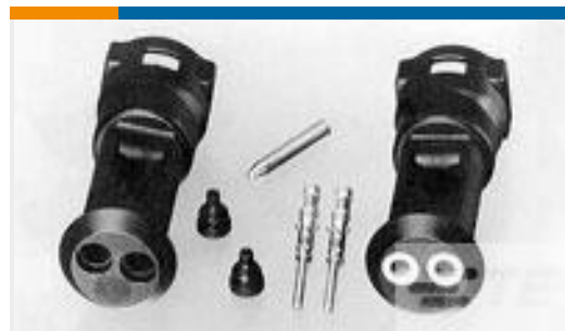
TE Part # 826883-1 2 POS ECONOSEAL PIN HSG ASSY