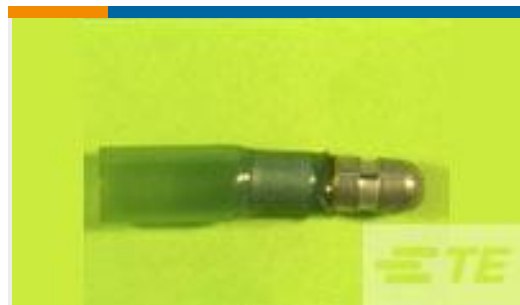
TE Part # 016529-000 B-106-8502