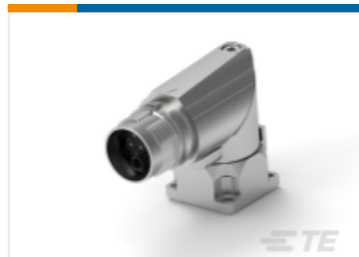
TE Part # AGC047N0000050A000 617 RECEPTACLE ANGLED ROTATABLE