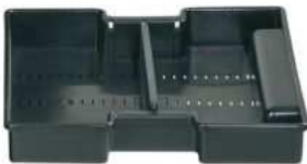
KIT TRAY MUB