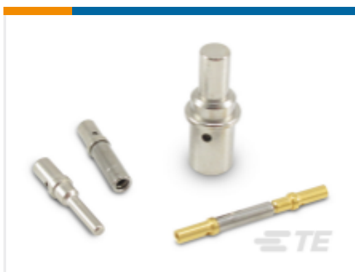
TE Part #0460-202-16141 DEUTSCH Solid Contacts