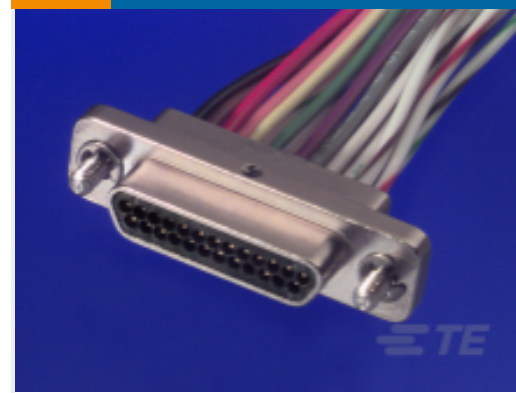
TE Part # 3-1532171-2 M83513/04-A16C, MCKS-C2-B-9S6Q9-72.0