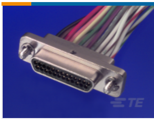
TE Part # 2-1532171-9 M83513/04-A13C, MCKS-C2-B-9S6G1-72.0