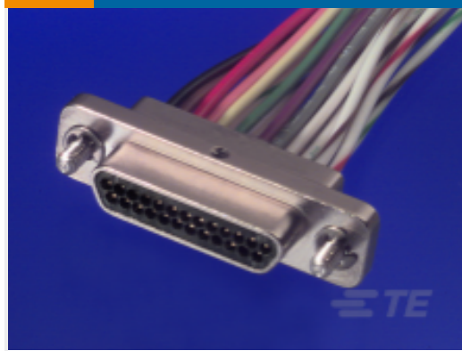
TE Part # 2-1532171-4 M83513/04-A08C, MCKS-C2-B-9S5L5-1.0