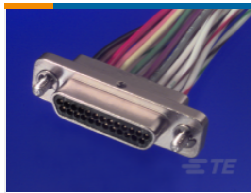
TE Part # 3-1532172-0 M83513/04-B14C, MCKS-C2-B-15S6G9-72.0