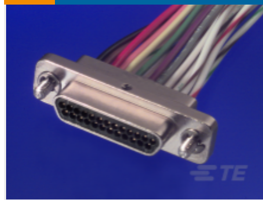
TE Part # 2-1532171-6 M83513/04-A10C, MCKS-C2-B-9S6Q1-36.0