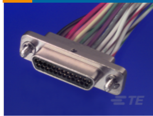
TE Part # 3-1532171-1 M83513/04-A15C, MCKS-C2-B-9S6Q1-72.0