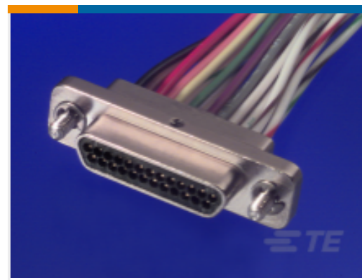
TE Part # 2-1532171-1 M83513/04-A05C, MCKS-C2-B-9S5L4-0.5