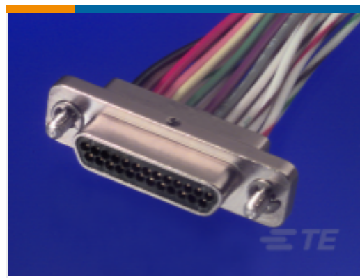
TE Part # 2-1532172-0 M83513/04-B04C, MCKS-C2-B-15S6G9-36.0