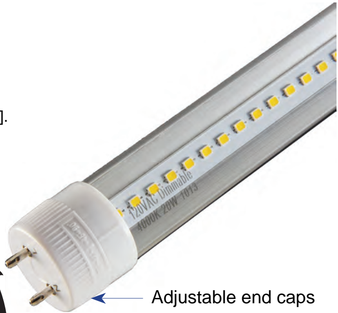
Adjustable end caps