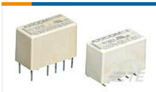
TE Part #1393788-3 V23079A1001B301