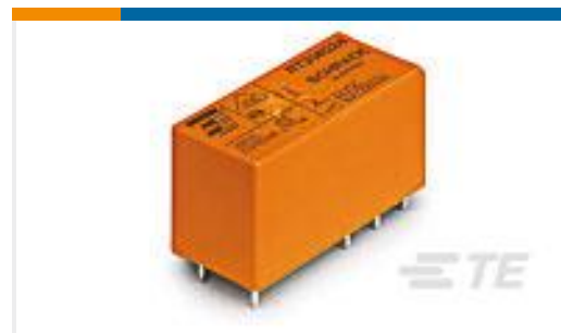
TE Part #1393240-7 RT314730