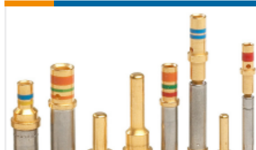
TE Part #81541-23 CONT PIN