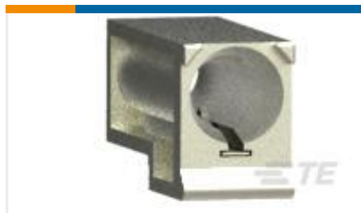
TE Part #1-1469492-1 MULTIGIG RT 9MM GUIDE/ESD 0 DEG