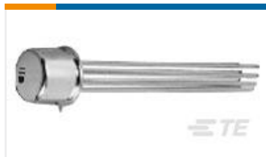
TE Part #1617121-9 JMAC-26XM = M39016/9-062M