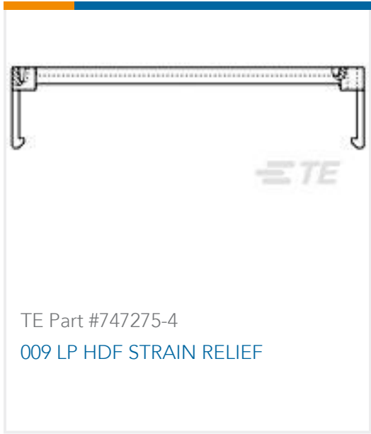
TE Part #747275-4 009 LP HDF STRAIN RELIEF