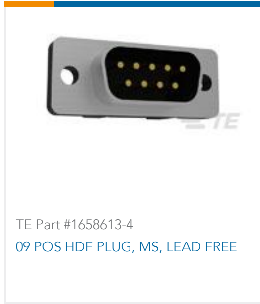
TE Part #1658613-4 09 POS HDF PLUG, MS, LEAD FREE