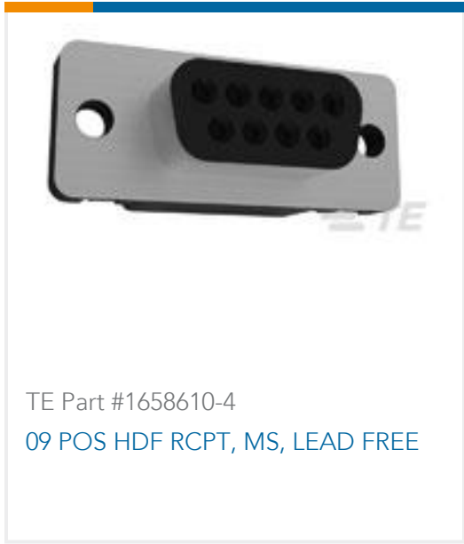
TE Part #1658610-4 09 POS HDF RCPT, MS, LEAD FREE