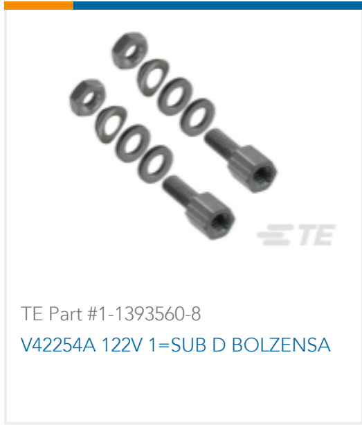
TE Part #1-1393560-8 V42254A 122V 1=SUB D BOLZENZA