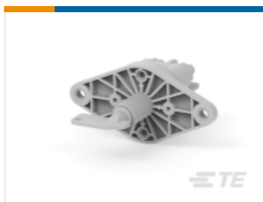
TE Part # K1158975 Battery Disconnecter 35-225-100-R-901