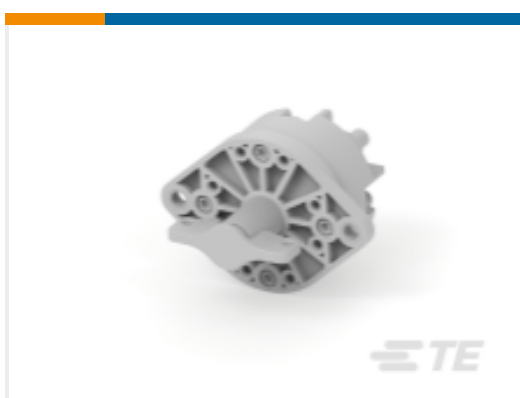
TE Part # K1162859 Battery Disconnecter 35-524-130-S