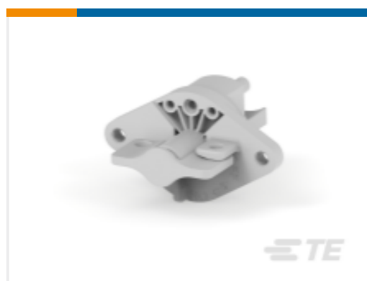
TE Part # K1137201 Battery Disconnecter 35-414-131-GE-900