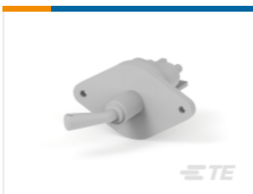
TE Part # K1162508 Battery Disconnecter 35-221-020-S